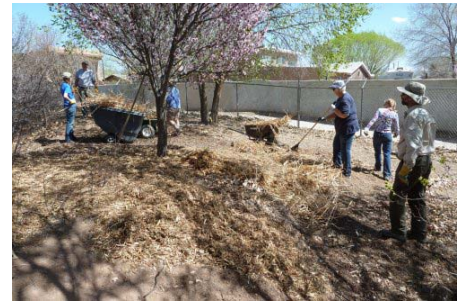
Volunteers spread cattail rushes and wood chips along the berm that backs up the wetlands pond at Montessori School of the Rio Grande.

It was an excellent way to kick off the 2011 season. We have six more projects this year and we hope to see you on one or two...or five!