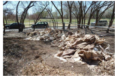
Yards of deteriorating plastic which lined the ground have been removed from beneath layers of lava rock, to make way for a more water-friendly mulch of wood chips.